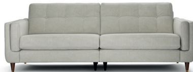
4 Seater Sofa H90cm W242cm D99cm