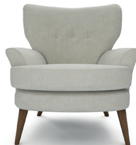
NOAH CHAIR Fabric Only H83cm W78cm D87cm