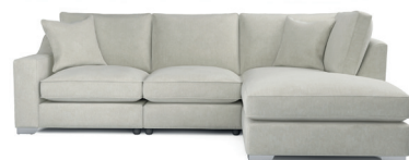
Chaise End Sofa (Left or Right) H82cm W271cm D194cm