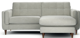
Chaise End Sofa (Left or Right) H90cm W210cm D166cm

Madison is available to order in a range of beautiful fabrics, and with a sprung seat and back and a choice of cushion fillings, you can create the perfect sofa for you and your home.