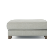
Footstool H39cm W88cm D67cm