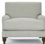
Chair H89cm W86cm D99cm