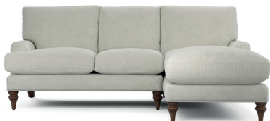
Chaise End Sofa (Left or Right) H89cm W210cm D158cm

A classic design updated for 21st Century living, Rose would make a stylish addition to any lounge. Details such as the hand-pleated arm and top-stitched cushions make this shape a true contemporary classic. Rose is available to order in a range of beautiful fabrics, and with a sprung seat and back and a choice of cushion fillings, you can create the perfect sofa for you and your home.