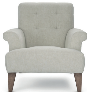
JOSEPH CHAIR Fabric or Leather H85cm W83cm D88cm