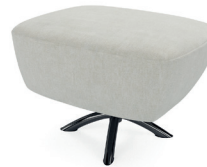
JACOB FOOTSTOOL Fabric or Leather H43cm W73cm D60cm