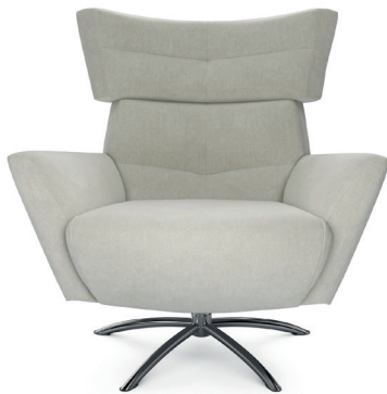
JACOB CHAIR Fabric or Leather H98cm W95cm D91cm

Find the perfect finishing touch for your home with an accent chair or footstool. Add a splash of colour or introduce vibrant pattern that will bring life to your lounge.