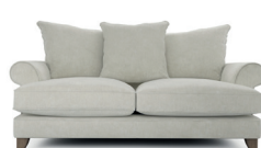
2.5 Seater Pillow Back Sofa H98cm W186cm D110cm