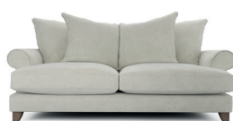
3 Seater Pillow Back Sofa H98cm W205cm D110cm