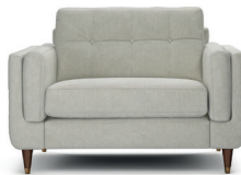
Snuggler H90cm W124cm D99cm