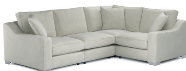
Corner End Sofa (Left or Right) H82cm W271cm D194cm