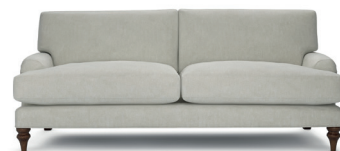
2.5 Seater Sofa H89cm W185cm D99cm