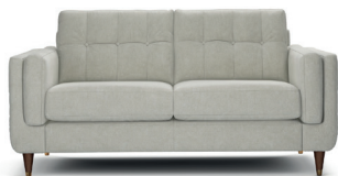
2.5 Seater Sofa H90cm W174cm D99cm